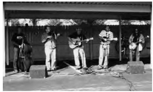
“Somewhere in Missouri”