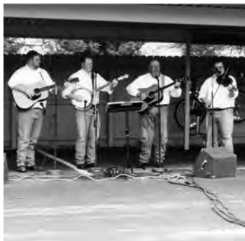
“The Red Haired Boys”